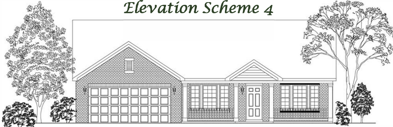
Full Front Brick w/Optional Full Front Porch & Railing